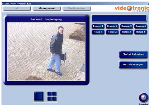
Single picture display