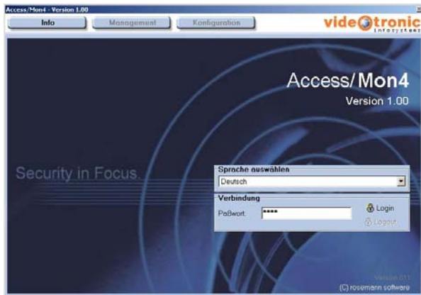
Start screen with password inquiry