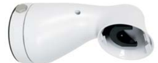
Vi-B3 Pendant mount