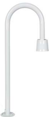
Vi-B5 Corner adaptor