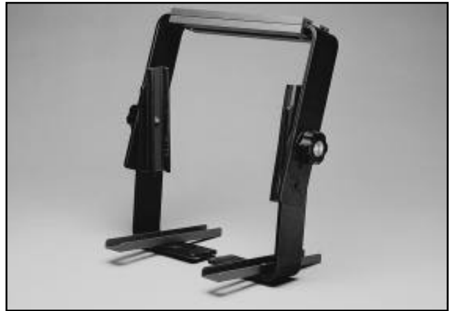
V1512MM-A MONITOR MOUNT