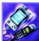
Remote Sentinel (click to enlarge)

Supplied with user-friendly Windows CE software, Remote Sentinel is the low-cost, easy to use solution for remote surveillance monitoring.