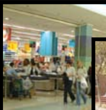
Retail chains, shopping malls