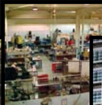
Industrial and production sites