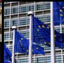
Organizations and distributed government sites