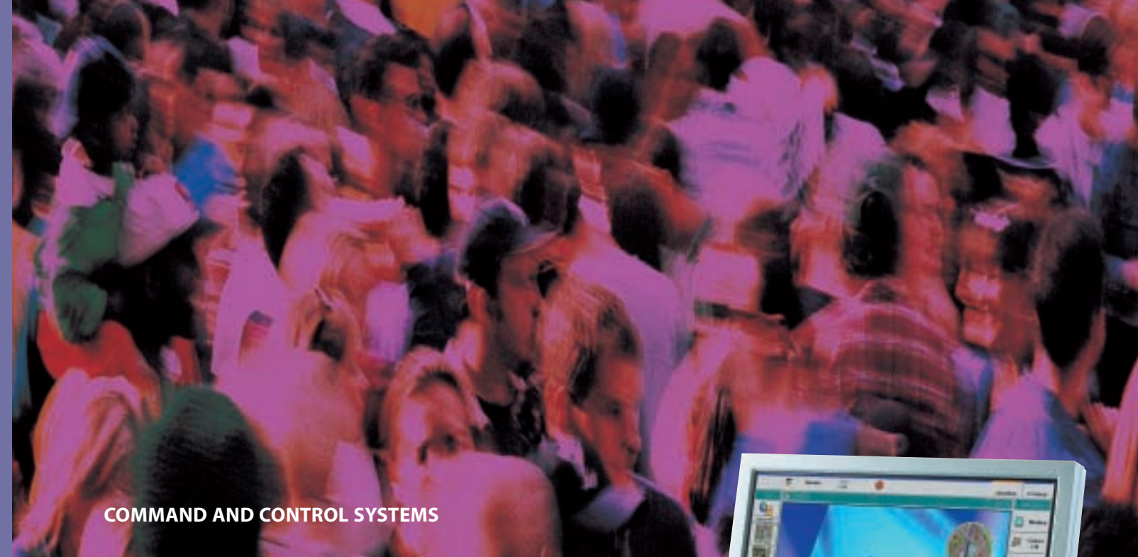
COMMAND AND CONTROL SYSTEMS