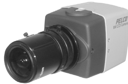
(LENS NOT SUPPLIED WITH CAMERA)

The MCC2400S-4 Series is one of Pelco's smallest and most economical cameras, providing true color reproduction and image quality at a great price. Its compact size makes it ideal for Pelco's DF5 and DF8 domes and EH100, EH2508, and EH3508 enclosures.