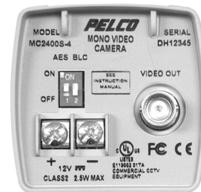
MCC2400S-4 REAR VIEW

The MCC2400S-4 Series has a standard CS lens mount, but with the optional PMCA40 lens adapter, C-mount lenses can be installed. A wide variety of fixed, varifocal, and zoom lenses can be used with either manual or auto iris. Auto iris lenses must be DC drive only. The iris is controlled through a standard four-pin square connector that is included on all Pelco auto iris lenses.