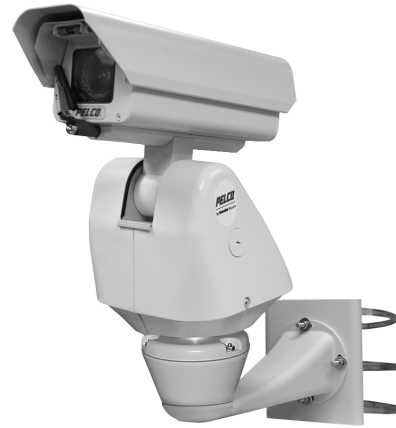
ESPRIT SE IOP SYSTEM WITH WIPER (SHOWN WITH WALL MOUNT AND POLE ADAPTER)

Pelco's ES40/ES41 Esprit® SE Positioning System features a receiver, pan/tilt, enclosure, and either an Integrated Optics Package (IOP) or a pressurized Integrated Optics Cartridge (IOC) in a single, easy-to-install system. Options include IOP or IOC models with or without wiper.