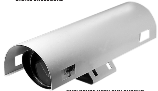
ENCLOSURE WITH SUN SHROUD

The EH8100 Series are sealed and pressurized outdoor enclosures designed to protect CCTV cameras operating in adverse environmental conditions.