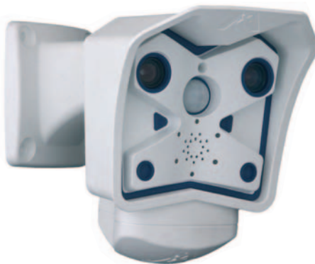
M12D with SecureFlex wall mount