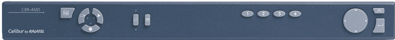
The CBR-4MD, a 4-camera, monochrome, duplex video multiplexer

The CBR-4MD is a high resolution multiplexer ideal for applications where real-time multiscreen images, detailed documentation and budget are concerns. All four camera inputs can be displayed during recording and playback in a quad format for complete security.