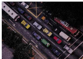
JVC Super LoLux™