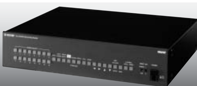
ZS-DX116P / ZS-DX116C / ZS-SX116P