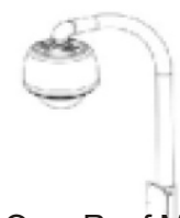
Over Roof Mount