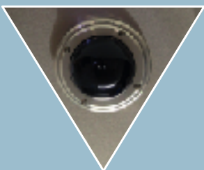
Stainless steel corner mount kit

Easy to install all cameras come complete with 1.8 metres BNC power cable, Stainless steel tamper-proof screws and Hex key as standard