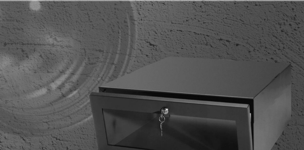
LTC 9022 Series shown.

The LTC 9022 Series and LTC 9023 Series are VCR lock boxes designed to prevent tampering of video cassette recorders. These units discourage tampering of preprogrammed recorders and erasure of tapes. Two models are available to accommodate most VCRs. A viewing window is included with the LTC 9022 Series units. All models may be used for safeguarding other devices, such as control units.