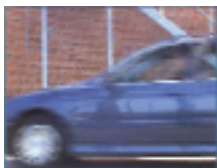
Interlaced, 20 ms difference between odd and even lines