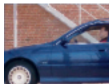
Progressive Scan, all lines are captured at the same time

Progressive scan is used instead of the interlaced method found in analog CCTV (PAL/NTSC) cameras. With progressive scan all pixels (lines) are captured at the same time, enabling moving images to be presented without distortion.