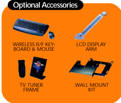
WIRELESS R/F KEYBOARD & MOUSE