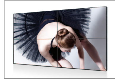
Tiling function and DVI looping simplify the video wall setup.