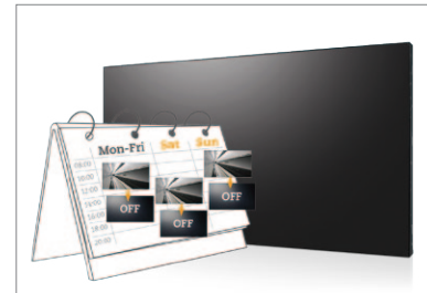
Built-in scheduler allows users to preset power on/off time and the designated input source.