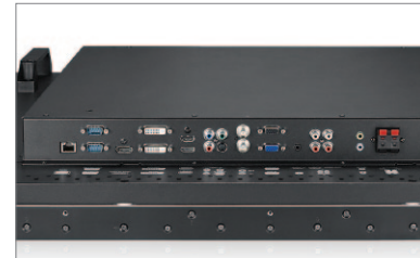
Versatile connectivity: VGA, DVI, HDMI, DisplayPort, CVBS, Component, S-Video.